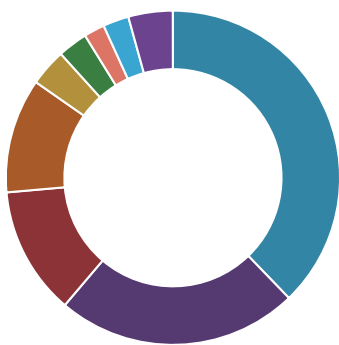
Asset allocation as at 31 Dec 2023

Fund manager information This fund is an Aegon Solution. This means it is a pre-built fund Aegon have created to offer whole investment strategies in a single fund with the aim of making investing easier. We reserve the right to add, remove and replace the underlying funds within this solution with the aim of making sure the fund continues to meet its aims and objectives. Sometimes we work with external fund managers and they select and manage the underlying funds on our behalf. The additional charges/expenses may change when underlying funds are replaced, added or removed from the portfolio or when weightings between the underlying funds are changed. Please note, there's no guarantee the fund will meet its objective.