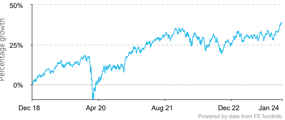
■ Growth Core Portfolio (ARC)

In the graph, performance is shown since launch if the fund is less than five years old.