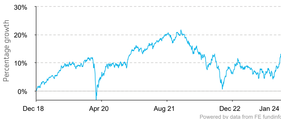
■ Cautious Select Portfolio (ARC)

In the graph, performance is shown since launch if the fund is less than five years old.