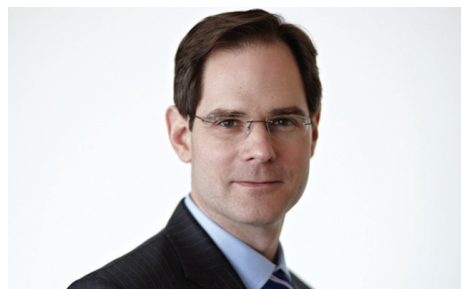
Fund manager: Invesco Global Asset Allocation Team 1

On 22 March 2024, the Invesco Balanced Risk 10 Fund (UK) will be terminated. Please note that from 20 December 2023, investments into the fund from new investors will not be accepted into the fund. In preparation for the termination, as of noon 8 March 2024, no further instructions to invest, sell or switch will be accepted from existing investors.