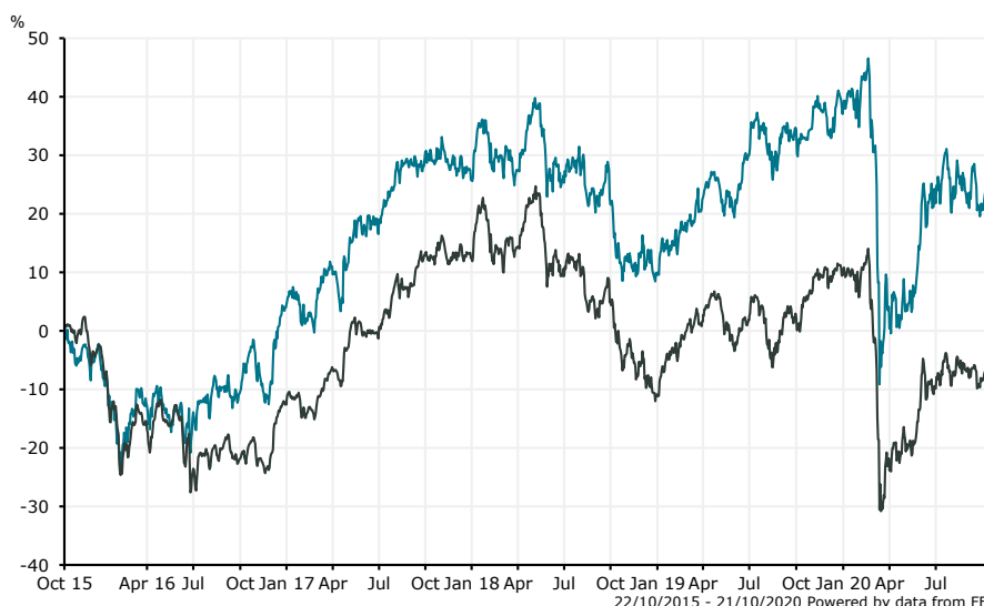
■ iShares FTSE MIB UETFInc £ ■ Equity - Italy