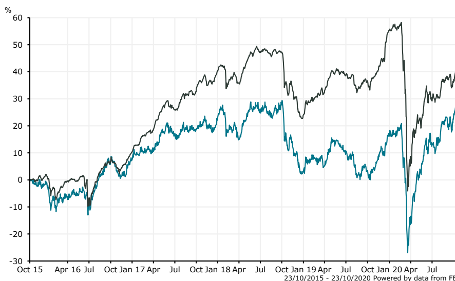
■ Baillie Gifford British SmCos B Inc ■ IA UK Smaller Companies