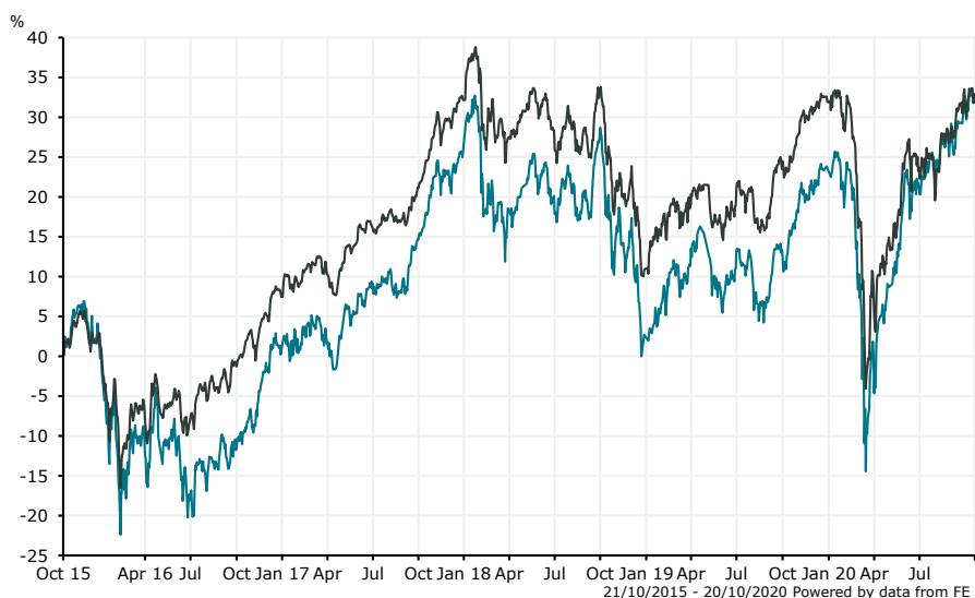
■ Capital Group JEQL ZhGBP £ ■ Equity - Japan