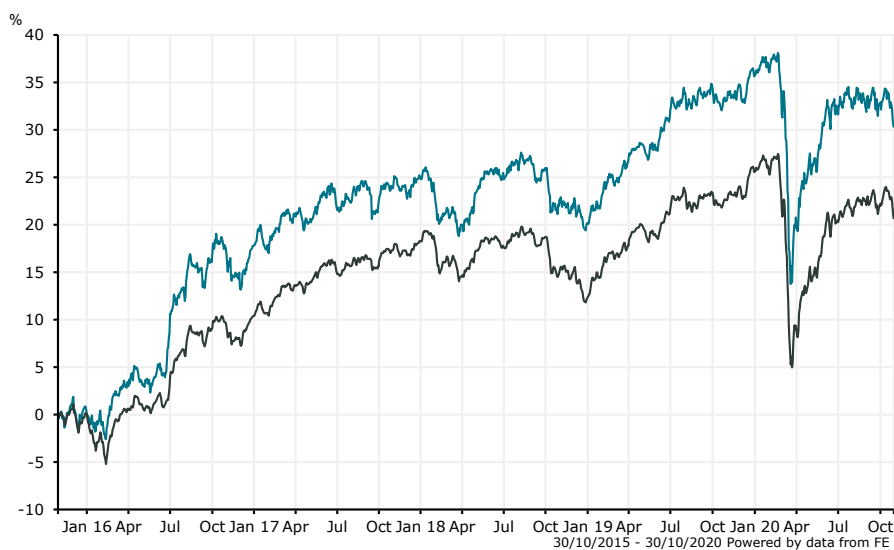
■ BlackRock NURS II Consensus 60 D ■ IA Mixed Investment 20-60% Shares