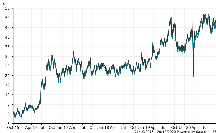
■ Vanguard UKInflLkdGltId A£ ■ IA UK Index Linked Gilts