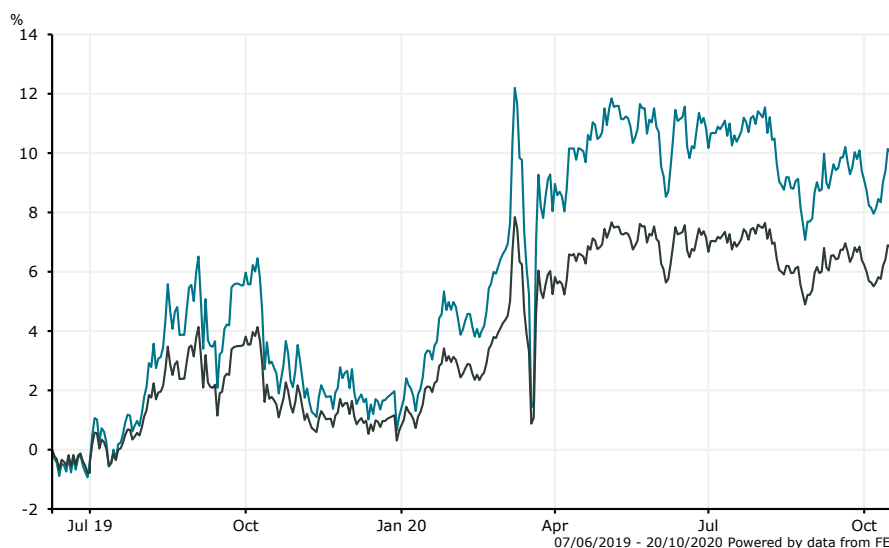
■ Invesco UK Gilts UCITS ETF Acc ■ Fixed Int - GBP Government